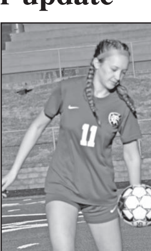
Lady Indians vs Frankin Co.

Towns County hosts Greene County on Tuesday in Region 8-A action. The girls game gets underway at 5:30 p.m. with the boys to follow.